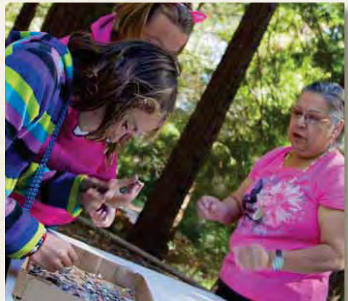
The next generation of environmental stewards learns to make abalone shell pendant necklaces from tribal members at the Girl Scout's Skylark Ranch camp.