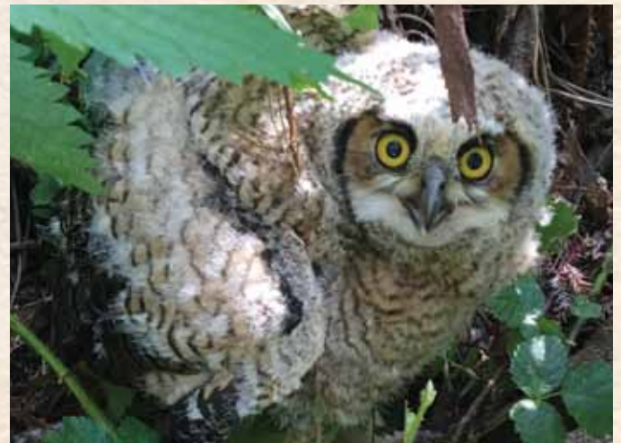
A great horned owl fledgling at the Cotoni-Coast Ridge property.

Spotting a great horned owl is a good indication that there is a healthy abundance of prey in the forest, so we were thrilled when we found this young owl on the Cotoni-Coast Ridge property (see page 1). Strong, diverse populations of wildlife are part of the makeup of a healthy forest ecosystem—the kind of healthy forest that you are helping to protect and connect in the Santa Cruz Mountains.