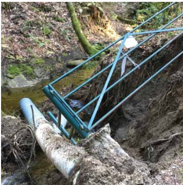
A metal gate and a culvert pipe slip down an eroded stream bank at Lompico Headwaters

Preparing for heavy rain in years of drought is a difficult and necessary task, and sometimes even careful planning isn't enough. More than 92 inches of rain produced an estimated $114 million in storm damage to roads in Santa Cruz County this winter. Our properties did not escape the torrent either; the rain had extensive impacts to the land you've helped protect - from collapsed gates to slumping roads and landslides carrying boulders the size of water trucks. To help address some of the immediate problems, we took part in collaborative efforts to identify damage and reopen roads critical to fire safety and emergency access. Streams and watercourses took a serious blow from the heavy erosion, so we have begun repairing and upgrading culverts to lower the potential for catastrophic failures in the future. We are even looking into creative solutions to reuse washed-out material to help strengthen sensitive stream banks. Your support helps us to respond to unexpected challenges like these, which will cost Sempervirens Fund well over $1 million. 🌲