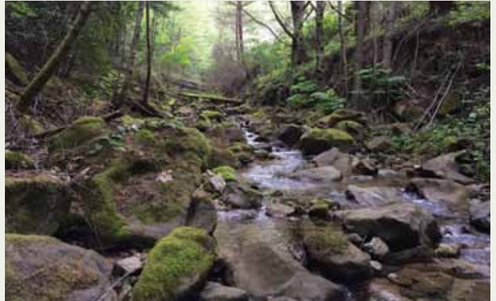
Location of the large woody debris project in San Vicente Creek

populations. The large woody debris also traps and stores sediment, which can act as a natural filter during large storm events like those we experienced this past winter. With your support and through careful, active management, we are helping to revitalize the forest and protect rare fish species. 🌲