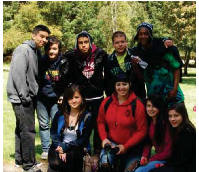
Andrew P. Hill High School students at Sanborn County Park.