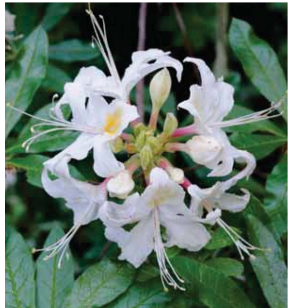
Azalea – Big Basin