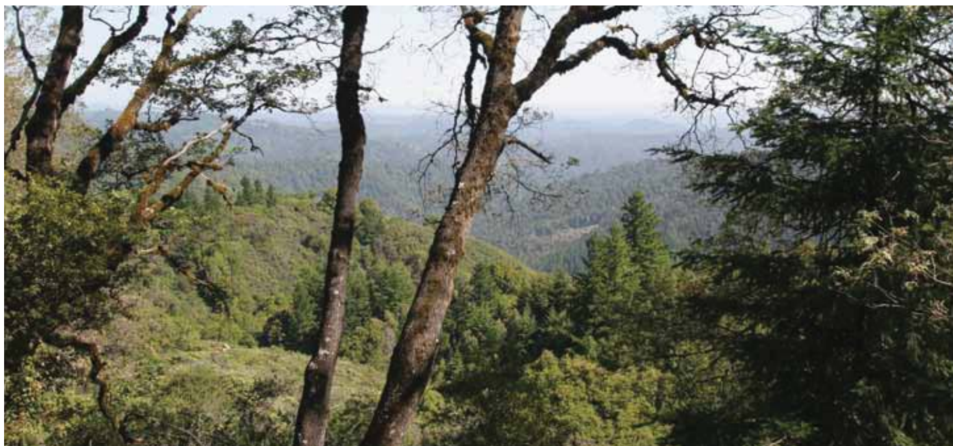
Castle Rock State Park