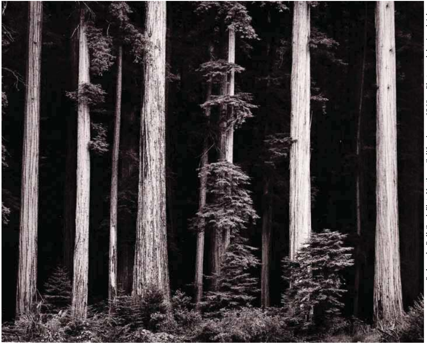
Redwoods, Bull Creek Flat, Northern California, ca. 1960.