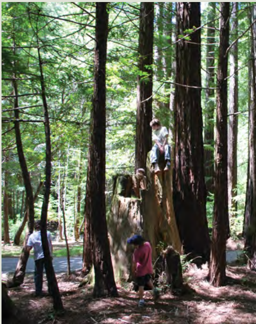
Little Basin

Despite California's economic struggles, Sempervirens Fund and California State Parks continue to work together to protect the coast redwoods of the Santa Cruz Mountains and to provide new opportunities for the public to enjoy them.