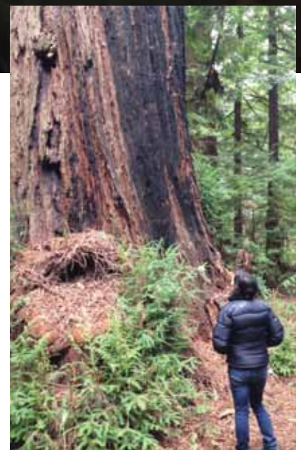
Project consultant Paige Rausser sizes up an old-growth redwood on one of the properties.

We are already negotiating the protection of seven of the CAPP priority properties totaling approximately 1,600 acres of beautiful redwood forests, wildlife habitat, watersheds, and recreational potential. We plan to acquire or place conservation easements on these properties to protect natural resources, connect park lands, and expand core areas of protected forests. With these projects in the works and more to follow, we are well on our way to creating the Great Park of the Santa Cruz Mountains. Watch for updates in future issues of Mountain Echo and at www.sempervirens.org . 🌲