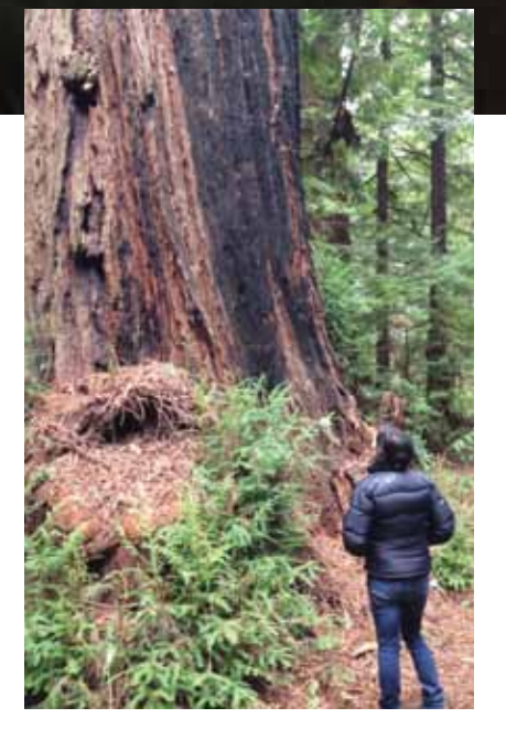
Project consultant Paige Rausser sizes up an old-growth redwood on one of the properties.

We are already negotiating the protection of seven of the CAPP priority properties totaling approximately 1,600 acres of beautiful redwood forests, wildlife habitat, watersheds, and recreational potential. We plan to acquire or place conservation easements on these properties to protect natural resources, connect park lands, and expand core areas of protected forests. With these projects in the works and more to follow, we are well on our way to creating the Great Park of the Santa Cruz Mountains. Watch for updates in future issues of Mountain Echo and at www.sempervirens.org.