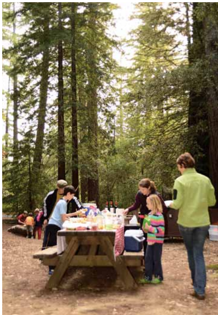
Big Basin picnic