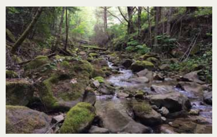
Location of the large woody debris project in San Vicente Creek

populations. The large woody debris also traps and stores sediment, which can act as a natural filter during large storm events like those we experienced this past winter. With your support and through careful, active management, we are helping to revitalize the forest and protect rare fish species.