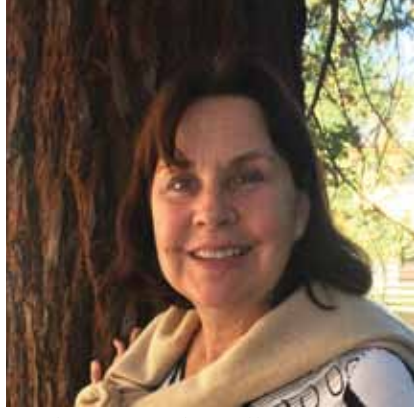
Barbara Lamb Hall