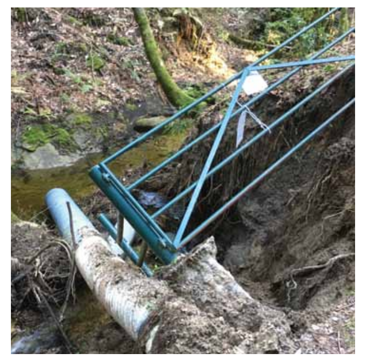
A metal gate and a culvert pipe slip down an eroded stream bank at Lompico Headwaters

Preparing for heavy rain in years of drought is a difficult and necessary task, and sometimes even careful planning isn't enough. More than 92 inches of rain produced an estimated $114 million in storm damage to roads in Santa Cruz County this winter. Our properties did not escape the torrent either; the rain had extensive impacts to the land you've helped protect - from collapsed gates to slumping roads and landslides carrying boulders the size of water trucks. To help address some of the immediate problems, we took part in collaborative efforts to identify damage and reopen roads critical to fire safety and emergency access. Streams and watercourses took a serious blow from the heavy erosion, so we have begun repairing and upgrading culverts to lower the potential for catastrophic failures in the future. We are even looking into creative solutions to reuse washed-out material to help strengthen sensitive stream banks. Your support helps us to respond to unexpected challenges like these, which will cost Sempervirens Fund well over $1 million.