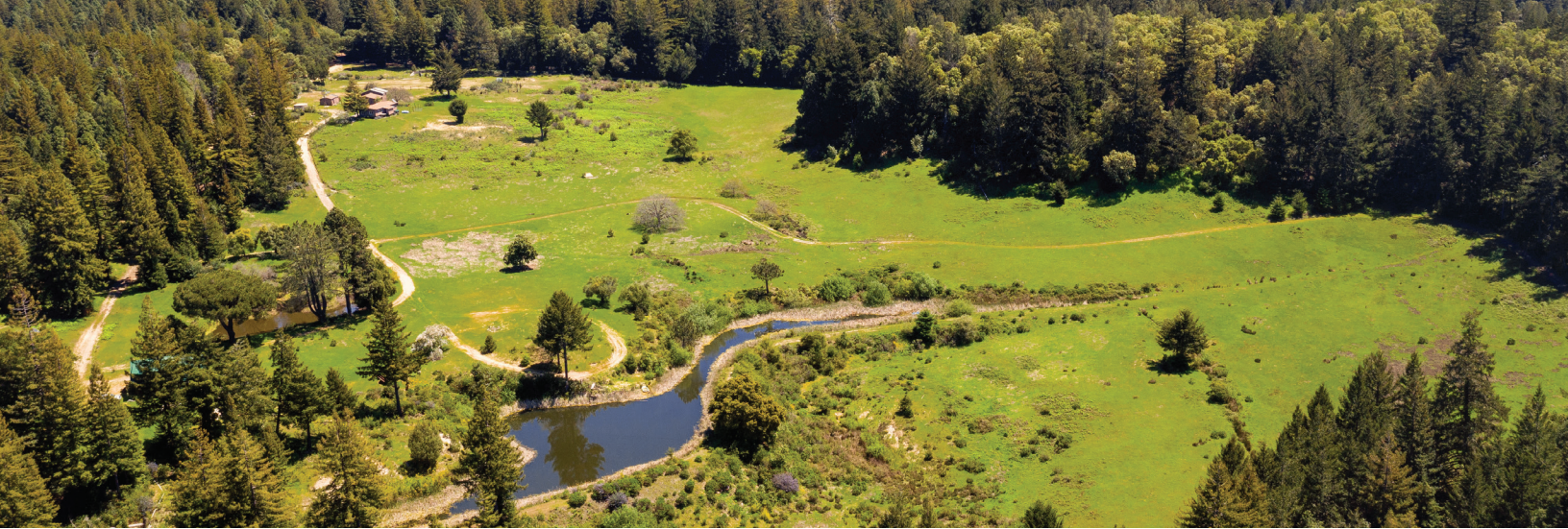
Filice Ranch: The 320-acre property is one of Sempervirens Fund's latest acquisitions, thanks to your generous contributions.