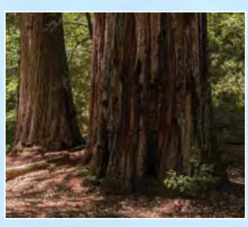
6. Skyline-to-the-Sea winds through pristine old-growth redwoods.