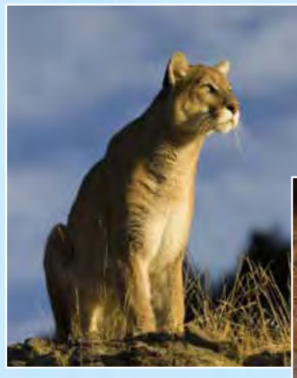
2. Mountain lions roam shyly, avoiding people and trouble.