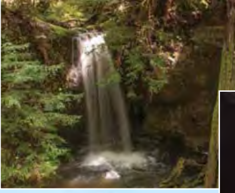
4. Berry Creek Falls empties into West Waddell Creek and into the Pacific.