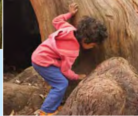
5. Kids love exploring the forest and learning about redwoods.