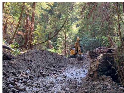
Site of the former CEMEX dam along Mill Creek in San Vicente Redwoods.